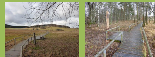
The Schopflocher Moor in the Swabian Alb.